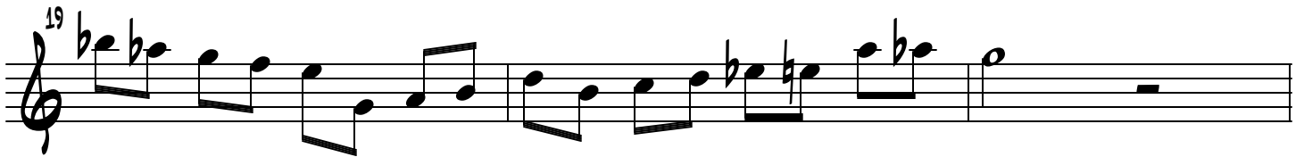
JACKIE MCCLEAN PLAYS THIS BEAUTIFUL PHRASE ON STELLA